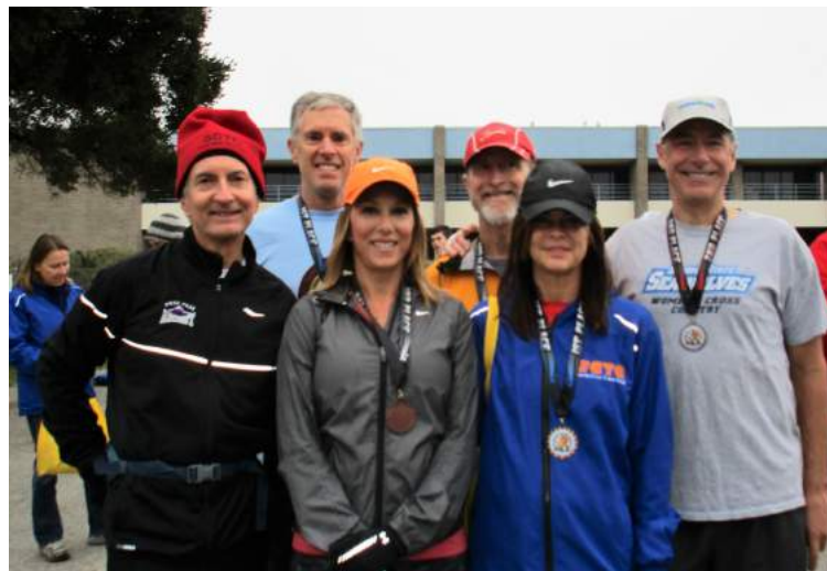
A happy group of award winning runners