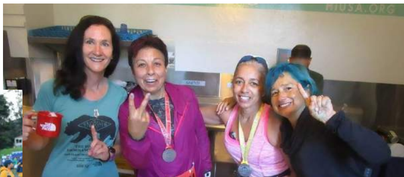
Age Division Winners