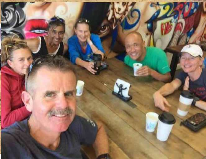
Chilling at Hippie Brew after the race