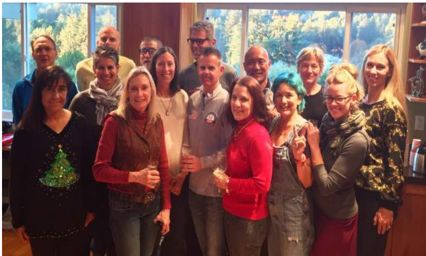
Cross Country crew celebrating a fantastic season!

SCTC went to the National Championships in Tallahassee, Florida on December 10. See inside Starting Lines for a full recap of the USATF Cross Country races and our SCTC team.